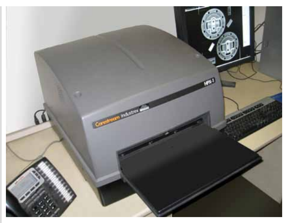
Today's computed radiography equipment produces high-quality, high-resolution images that are significantly more precise than those captured on film.

The CR inspection process is similar to conventional radiography (RT) but has a few key differences. A source of radiation, such as X-ray, cobalt, iridium or selenium, is selected based on the thickness and material of the part, and the procedure according to which the part needs to be radiographed, for example, AMS STD 2175 and ASTM E 1742 used for a wide array of tests on castings. Some procedures have not yet adopted the use of CR, but it will not be long before many will accept the digital medium over conventional film.